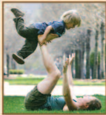
▲ Chicago's Millinneum Park

Cosmopolitan Chicagoans with a love for the outdoors have over 550 public parks to walk, run, skate, bike, picnic and play in. The parks are managed by the Chicago Park District. Early Chicago philanthropists like Montgomery Ward and Marshall Field financially and politically supported preserva-